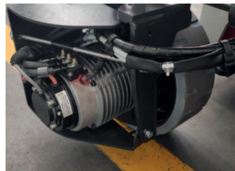
AC electric motor. 90° wheel steering.