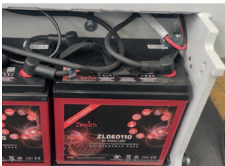
AGM batteries compartment.