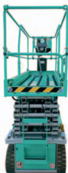
New design of the AWP, of the scissor package and of the self-locking entrance gate.