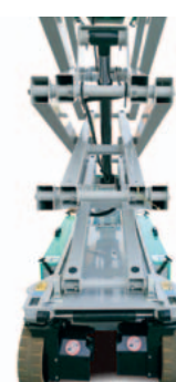
New design of the chassis which allows easy cleaning and ensures protection to the components.