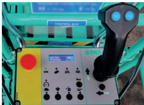
Control panel on the platform with capacitive buttons: simplicity and safety of use.