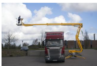
Up and over