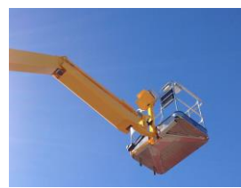
Flush basket mount